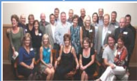
Class of 1980 celebrating 30 years!