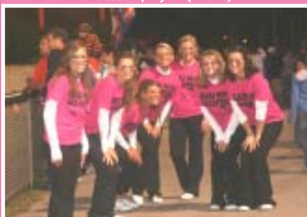
St. Teresa Cheerleaders (above)