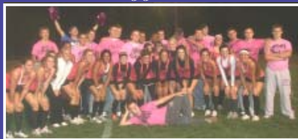
Seniors (below) beat the Juniors (above) at the annual Powder-Puff Game