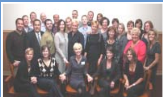
Class of 1985 Celebrating 25 Years!

A special thank you goes out to our entertainment sponsor: Tommy House Tire Co. Thank you for funding the All American Dueling Pianos!!!