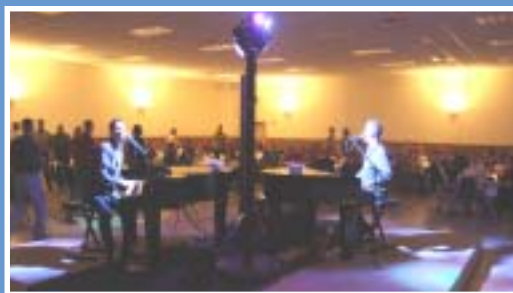
Gloglee Musicians: All American Dueling Pianos